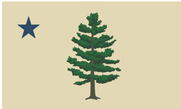
proposed new flag

The proposed law would also repeal requirements that the flag and staff be of certain dimensions and include a fringe and tasseled cord.